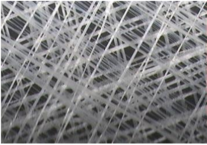
PVDF scaffold close-up.

An electroactive device is applied to an external wound site. This method utilizes generated low level electrical stimulation to promote the wound healing process while simultaneously protecting it from infection. The material is fabricated from polyvinylidene fluoride, or PVDF, a thermoplastic fluoropolymer that is highly piezoelectric when poled. The fabrication method of the electroactive material is based on a previous Langley invention of an apparatus that is used to electrospin highly aligned polymer fiber material. A description of the fabrication method can be found in the technology opportunity announcement titled "NASA Langley's Highly Electrospun Fibers and Mats," which is available on NASA Langley's Technology Gateway.