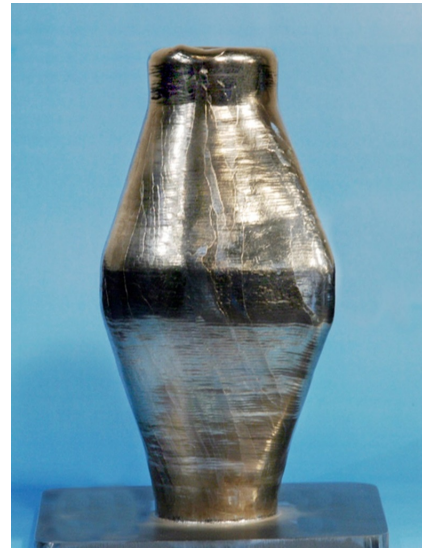
Finished structural part created with EBF3

EBF3 incorporates the following technologies, which can also be licensed individually: (1) a vapor-barrier vacuum isolation system that maintains a vacuum in the electron beam column adjoined to another chamber at higher pressure without loss of vacuum; (2) a system that controls and measures the height of an additive layer of metal using an electron beam in combination with a sensor and image processor; (3) a gas phase alloying system for wire fed joining & deposition, which is being developed for the controlled introduction of gases into molten metals in order to selectively impart beneficial properties to the final product (e.g. strength, corrosion resistance, etc.); and (4) a closed-loop system that is being developed to detect various fabrication anomalies and automatically send feedback to the fabrication system to modify the input parameters to maintain process consistency.