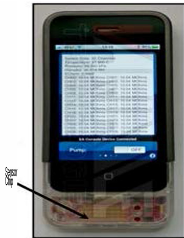
Cell phone sensor chip