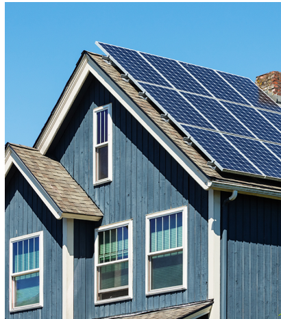
Glenn solar cell provides unprecedented efficiencies for solar roof tiles