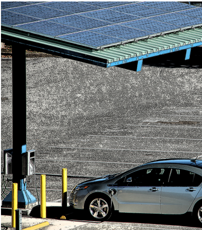
Glenn's high-efficiency solar cell can be used for electric vehicle charging stations

This is an early-stage technology requiring additional development. Glenn welcomes co-development opportunities.