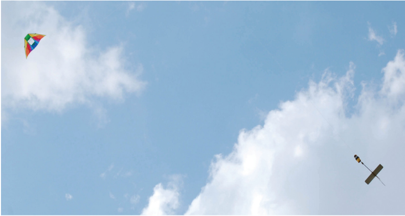
The Air Column Profiler Aeropod, being flown by a kite in the above photo, is used to capture a variety of atmospheric parameters throughout the air column.

The AeroPod is superior to the traditional Picavet pulley-style suspension system for kite-flight because its light weight, simple to construct, and has no moving parts. Furthermore, the AeroPod design is advantageous to the traditional tethered blimp suspension technique where tether motion is translated directly to the sensor system because the AeroPod is free of direct motions of the tether.