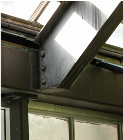
The High-Performance Polyimide Powder Coatings could potentially be used in I-beams to prevent corrosion

However, KSC's newly developed polyamic acid resins with low melting points can be used in a powder coating. These polyamic acid resins, when sprayed onto metal surfaces, can be cured in conventional powder coating ovens to deliver high-performance polyimide powder coatings. The polyimide powder coatings offer superior heat and electrical stability as well as superior chemical resistance over other types of powder coatings.