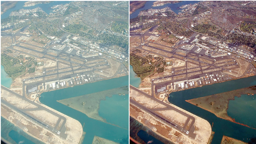
Aerial photo before enhancement

The invention was developed to provide completely new capabilities for exceeding pilot visual performance by clarifying turbid, low-light level, and extremely hazy images automatically for pilot view on heads-up or heads-down display during critical flight maneuvers.