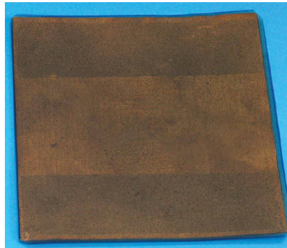
SansEC circuit underneath a chemically selective reactant