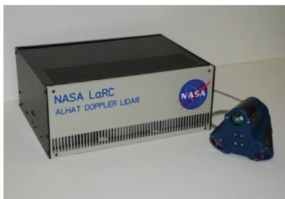
A Coherent Doppler Lidar developed for planetary landing applications utilizing a linear frequency modulation technique.

Previous attempts at laser frequency modulation that relied on adjusting the laser cavity length have resulted in only sine wave or imperfect triangle waveforms. Heterodyning of imperfect, non-linear waveforms or sine waveforms will significantly degrade the effective signal-to-noise ratio, making such systems impractical. In contrast, the current technology produces a single, high-frequency laser that is passed to an electro-optical modulator, which generates a series of harmonics. This range of frequencies is then passed through a band-pass optical filter so the desired harmonic frequency can be isolated and directed toward the target. By modulating the electrical signal applied to the electro-optical modulator, a near perfect triangular waveform laser beam can be produced. Transmission and detection of this highly linear triangular waveform facilitates optical heterodyning for the calculation of precise frequency and phase shifts between the output and reflected signals with a high signal-to-noise ratio. By combining this information with the time elapsed, the location and velocity of the target can be determined to within 1 mm or 1 mm/s.