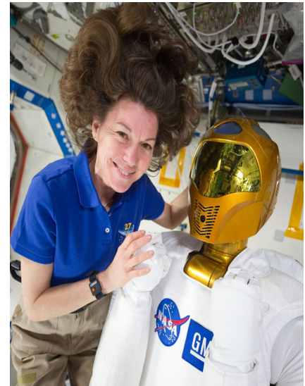
Robonaut 2 is capable of working safely side-by-side with astronauts on the International Space Station.

Robonaut 2 is a humanoid robot with many capabilities that allow it to perform tasks normally not done by robots.