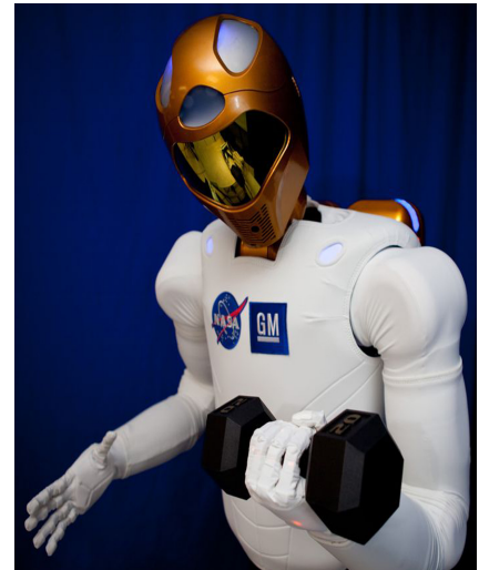
Robonaut 2 lifting a 20 lbs weight with one hand, showing the robot's strength and endurance.

R2 is a humanoid robot with many capabilities that allow it to perform tasks normally not done by robots.