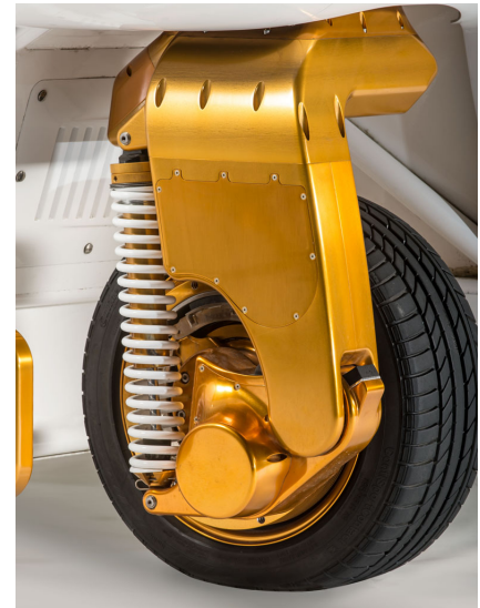
eCorner allows for 180 degree steering at each wheel.