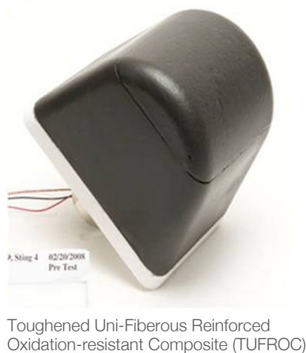
Toughened Uni-Fibrous Reinforced Oxidation-resistant Composite (TUFROC)